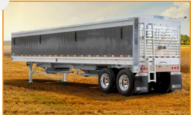
CARBON GRAY SIDE SKINS WITH STAINLESS STEEL FRONT AND REAR WALLS.