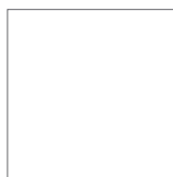
White (Standard finish)